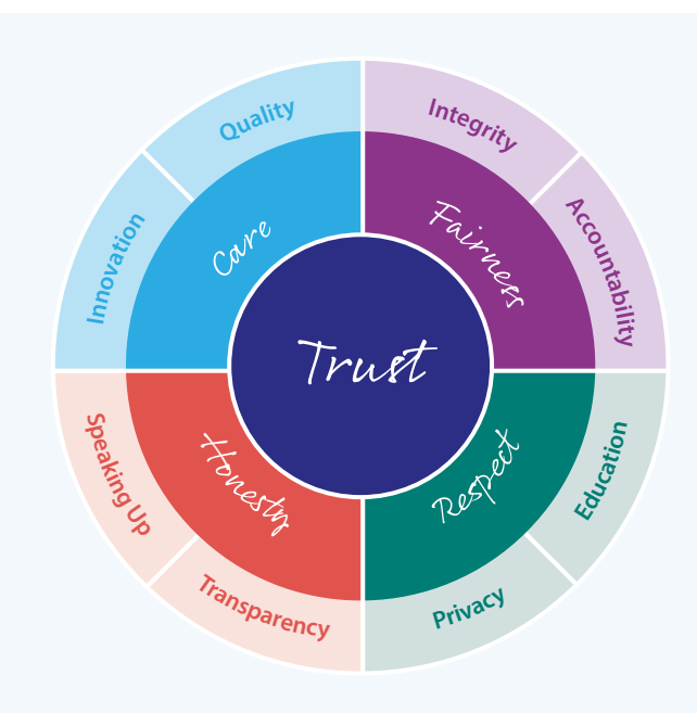
IFPMA Ethos > Building a culture of trust

Moving together begins with building a culture of trust. This is why our industry prioritizes ethics and business integrity in all of our relationships, establishing a foundation that is based on the core values of care, fairness, respect, and honesty that aligns with society's expectations, with patients at the core of everything we do. Over the past decade, our industry has seen rapid worldwide adoption and implementation of industry codes of conduct. These codes have enabled the formation of national "consensus framework" agreements that now span five continents, bringing together diverse healthcare ecosystems—industry, government, patients, and healthcare professionals and providers—for the first time.